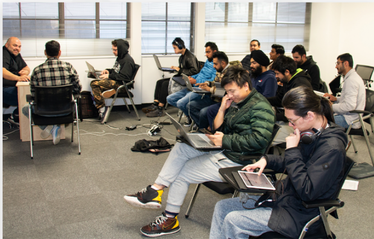
Level 3, 90 King William Street, Adelaide, SA.

Modern Facilities Moodle Classroom | Printing for students | Wi-Fi Access - Computer lab | Equipped Facilities